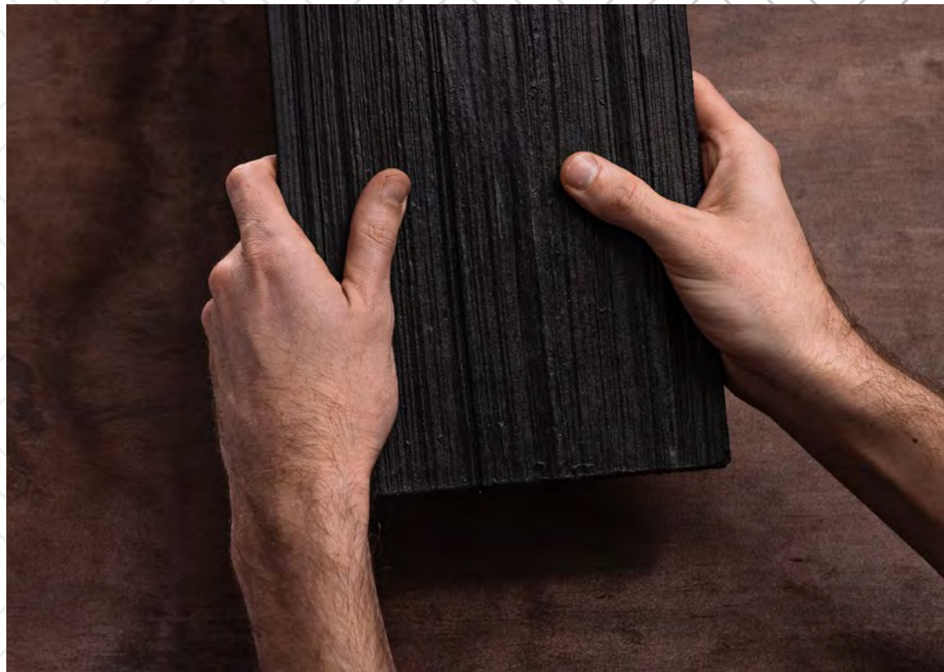
Brava Cedar Shake Arendale

Once you see it for yourself, you'll understand the combination of artistry and technology that goes into every Brava shake. There is no comparison.