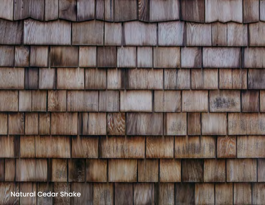
Natural Cedar Shake

The beauty of cedar shake: Not every shingle is alike.