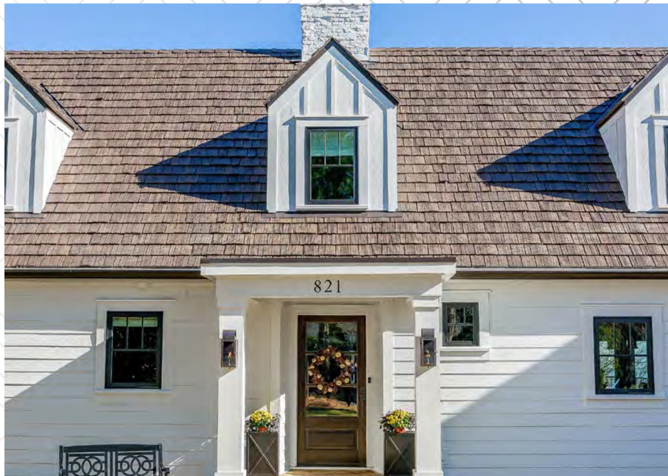
Brava Cedar Shake Lake Forest

Brava uses state-of-the-art compression molding technology, making it the strongest shake available. It's this attention to detail that makes Brava stand above the competition.