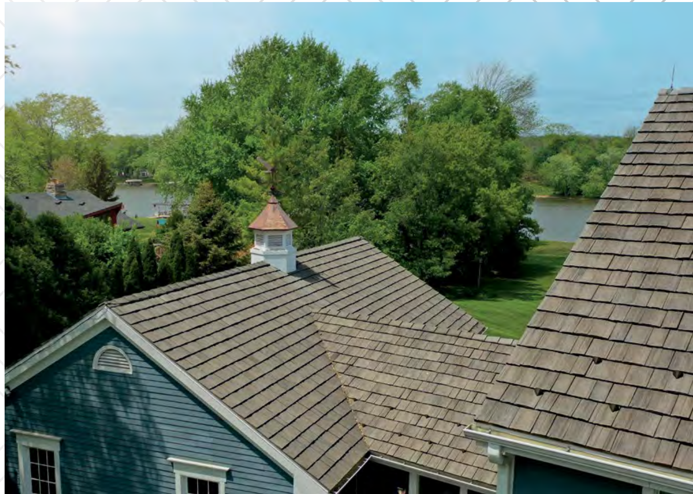
Brava Cedar Shake Lake Forest

Brava shakes are crafted with a blend of high-grade, high-spec pre-consumer recycled plastic, natural minerals, and binders.