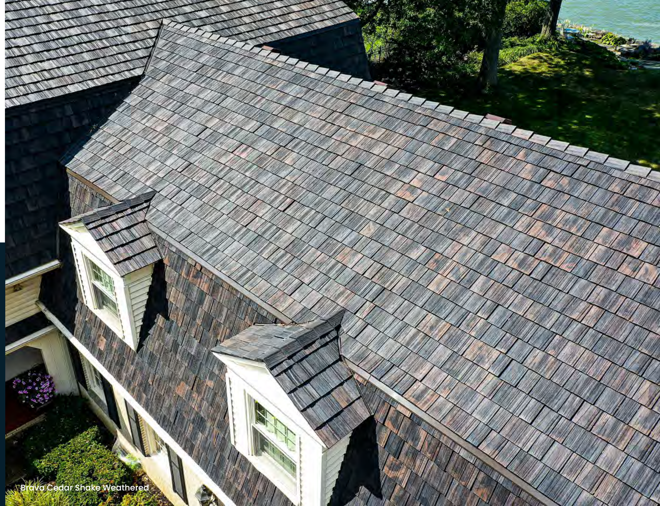
Brava Cedar Shake Weathered