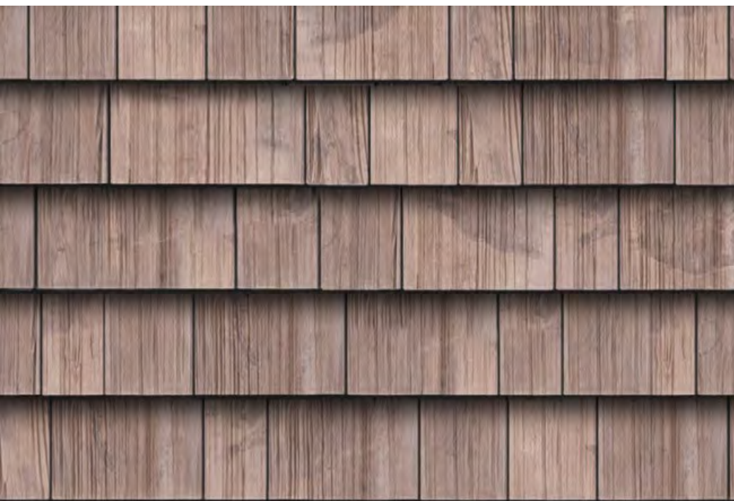
Brava Cedar Shake Sierra

The beauty of Brava Roof Tile: Not every synthetic shake is alike.