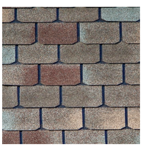
COMPETITOR ASPHALT SLATE