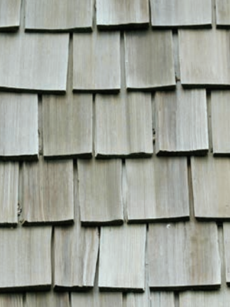
NATURAL CEDAR SHAKE

Natural slate and shake are incapable of achieving DaVinci's top-notch performance.