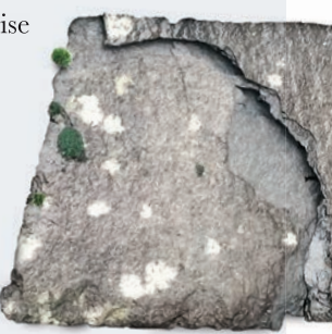
There's no denying the beauty of natural slate and shake—the problems aren't aesthetic. Issues arise in performance. The beauty of real cedar shake is fleeting; it is prone to damage and does not provide color stability. And unlike DaVinci, natural slate does not live a maintenance-free life and cannot stand up to Mother Nature's fury. When it comes to composite roofing, DaVinci Bellaforté reigns supreme and can perfectly mimic the allure of the real thing.