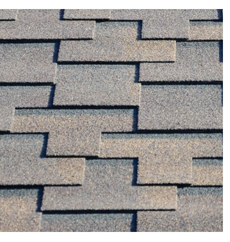
COMPETITOR ASPHALT SHAKE