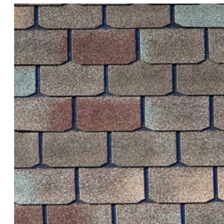
COMPETITOR ASPHALT SLATE