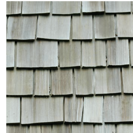
NATURAL CEDAR SHAKE