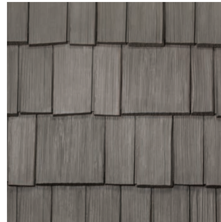
DAVINCI BELLAFORTÉ SHAKE

Natural slate and shake are incapable of achieving DaVinci's top-notch performance.