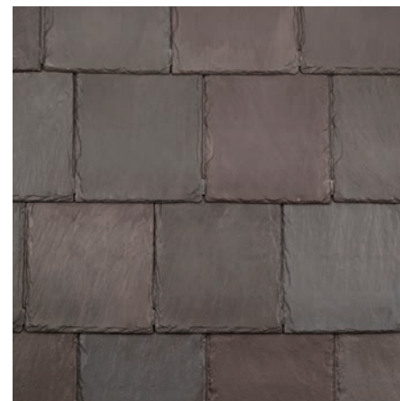
DAVINCI BELLAFORTÉ SLATE