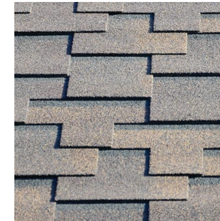
COMPETITOR ASPHALT SHAKE