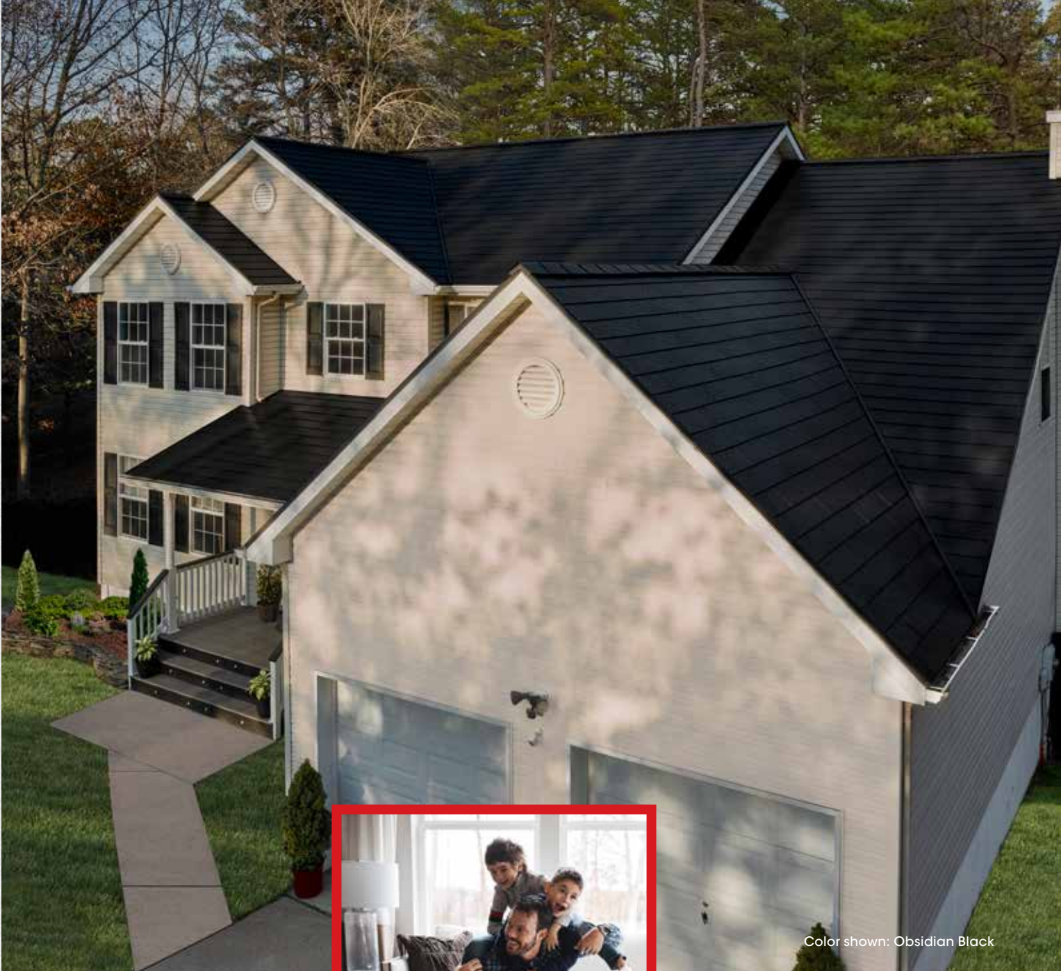
Color shown: Obsidian Black